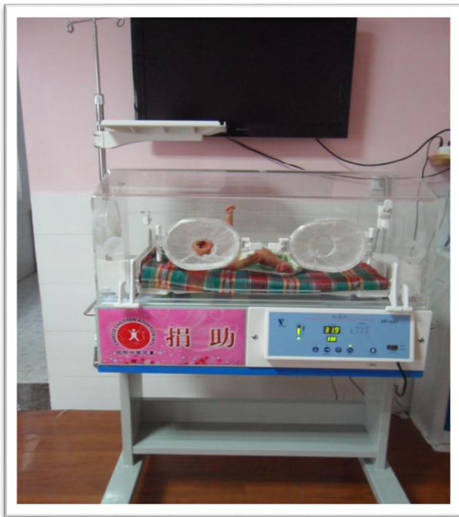
Another Kaifeng Incubator